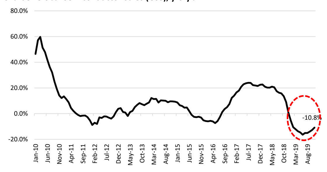
Chart 5: Global Semiconductor Sales (GSS), y-o-y %