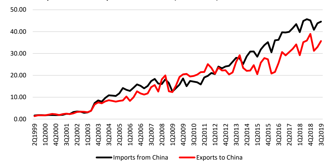
Chart 4: Exports to and Imports from China (RM billion)

However, there seems to be a glimmer of hope as the tech sector has started to bottom out. The Global Semiconductor Sales (GSS) registered slower contraction at 10.8% in November 2019 as compared to negative growth of 12.7% in October 2019. Similarly, the degree of Malaysia's E&E exports has softened to -5.4% in December from 11.6% contraction in the previous month. As such, there would be a case that the semiconductor exports would performed better in 2020 especially in the context of the expected roll-out of 5G network this year. As such, we expect nominal exports would grow between 1.8% to 2.0% in 2020 due to the low base effect as well as recovery in tech related exports. However, we will make the necessary adjustment should the coronavirus outbreak become protracted and severely impacted the China's growth momentum.